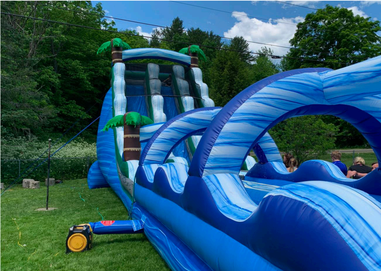
Giant water slide at RVS! The PTO rented a 22-foot inflatable water slide from Sky High Slides and Such for the school's annual field day on June 6.

Looking forward to everyone reconnecting and enjoying the day! For any questions or suggestions please contact Mary Bouchard at 485-5585 🏠