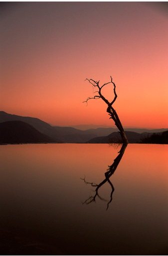
“Infinite,” 2024 Josh Axelrod Film photograph