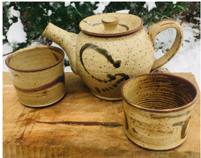
Tea Set, Peter Evans Pottery