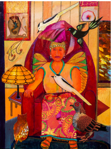
“Wise Woman,” Jane Pincus, acrylic & collage painting